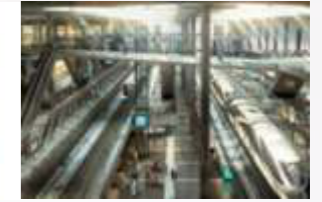
Doha Metro, Qatar