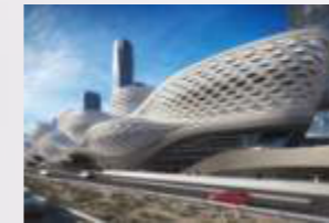
Riyadh Metro, KSA