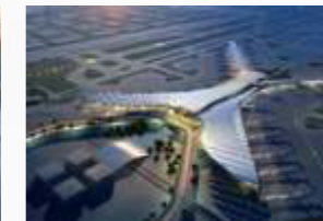
Expansion of King Abdulaziz International Airport, KSA