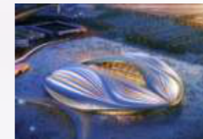
World Cup Stadiums, Qatar