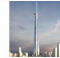
Jeddah Tower (1 km long), KSA